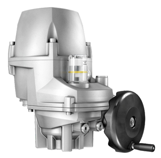
PROFOX multi-turn actuators PF-M25X, PF-M50X, PF-M100X