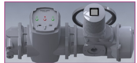
SA/SAR+Epac actuator with plug-in type terminals