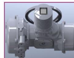
SA/SAR actuator with screw type terminals