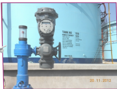
Auma India Actuators @ HPCL Loni Marketing Terminal

Auma India has bagged orders for supplying explosion proof actuators (546 nos.) with Fieldbus Protocol for the automation of various Indian Oil Corporation Ltd. (IOCL) terminals. Auma India's scope of work consists of commissioning of actuators for the automation of both existing and new valves. Earlier, Auma India has carried out similar work for HPCL and BPCL terminals.