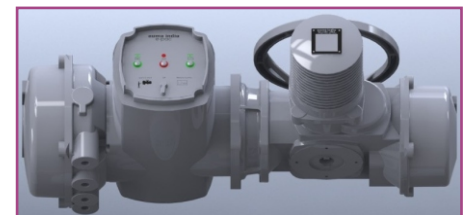
SA/SAR+Epac actuator with screw type terminals

Customers can download 3D solid models from the links given below: