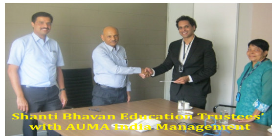
Shanti Bhavan Education Trustees' with AUMA India Management