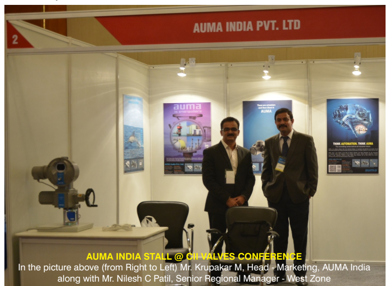
AUMA INDIA STALL @ CII VALVES CONFERENCE