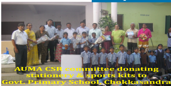
AUMA CSR committee donating stationery & sports kits to Govt. Primary School, Chokkasandra