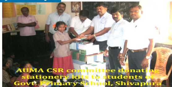
AUMA CSR committee donating stationery kits to students of Govt. Primary School, Shivapura