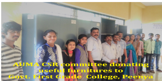
AUMA CSR committee donating useful furnitures to Govt. First Grade College, Peenya