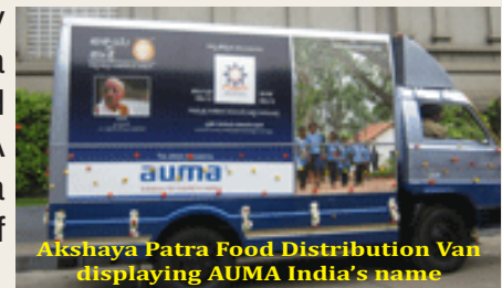
Akshaya Patra Food Distribution Van displaying AUMA India's name

AUMA India as a part of corporate Social Responsibility activity has provided two food distribution vans to ISKCON for 'Akshaya Patra' service that provides mid-day meals for the schools in and around Bangalore serving needy school children. So far, AUMA India has donated 9 food distribution vans to Ashaya Patra Foundation as a part of CSR activity towards the development of local community.