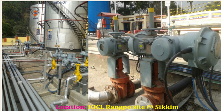
Location: IOCL Rangpo site @ Sikkim

AUMA India has been carrying out various Service & commissioning activities - R & M/ AMC support for the retrofit of actuators across various customer sites viz. IOCL Rangpo site at Sikkim, Oil India - Duliajan & Moran, BPCL - Kochi in the last quarter. Under Asset management - overhauling & maintenance, AUMA India offers the maintenance and inspection service at regular intervals, adapted and defined in accordance with the customized requirements.