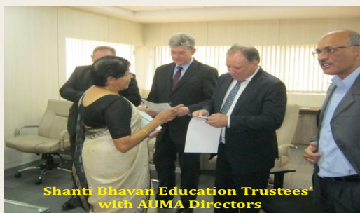
Shanti Bhavan Education Trustees with AUMA Directors

AUMA India has provided a significant contribution to support the activities of 'Shanti Bhavan Education Trust' which aims to alleviate poverty, promote environmental health and strengthen democratic institutions & values in developing countries.