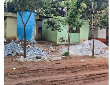
Identified place for construction of one block

Auma India had earlier constructed a block with six fully furnished classrooms in the Nammura Government High School, Nelagedaranahalli. This is in line with Auma India's mission to support education for underprivileged children in and around Peenya, Bangalore and it has been successful in fulfilling this goal in past years.