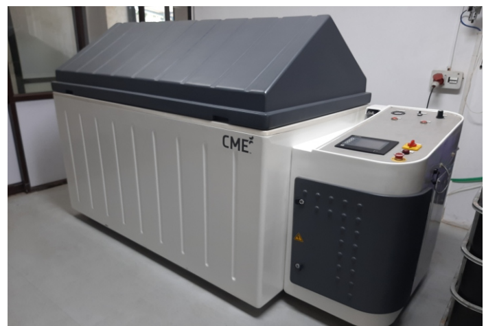
Salt spray testing machine