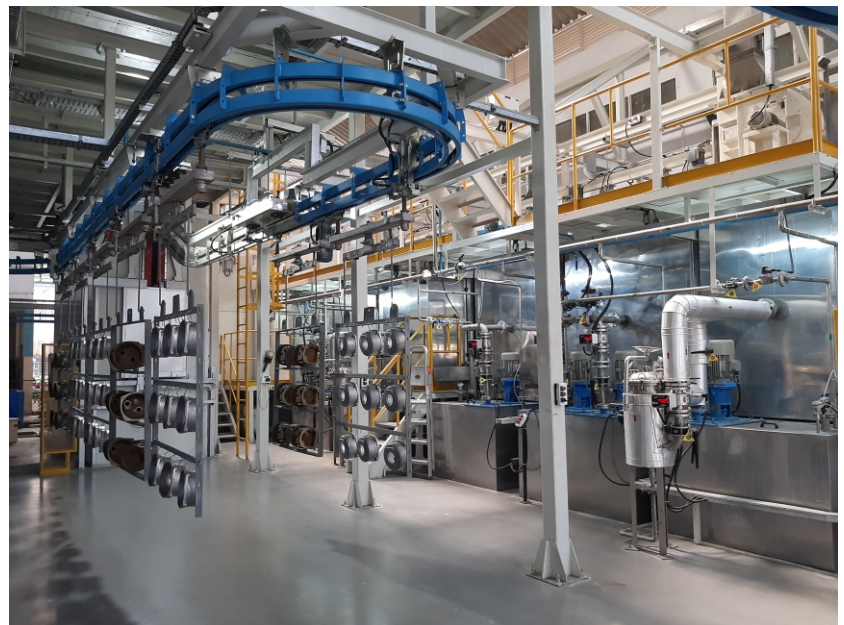
New Paint Line