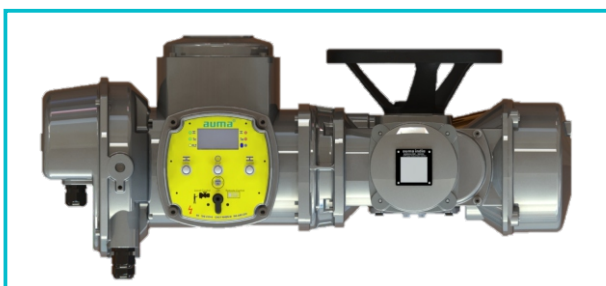
AUMA's electric actuator with controls in SIL version

In the past, AUMA has supplied a number of electric actuators with controls in SIL version for various NTPC FGD installation in India.