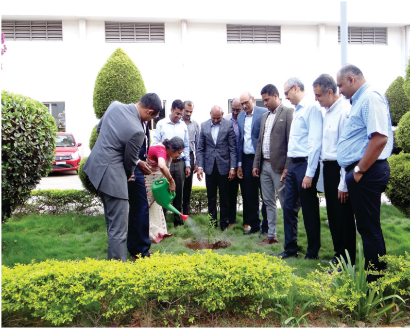
• Founding members at launch of IVAMA Association @ Auma India Pvt Ltd planting the sapling on 8th April 2019

India is a hub for the manufacturing of Engineered Valves and is home to several large manufacturers with a much larger base of smaller manufacturers. There are dedicated industry associations in almost all the major valves and actuators manufacturing countries, but this was not the case so far in India. Hence a need was felt to build a dedicated platform for Valve and Actuator Industry. Auma India was actively involved along with other major players of Industry to form IVAMA Association. A sapling was planted at the premises of Auma India Private Limited, Bangalore by the founding members on 8th April 2018 to mark the beginning of the idea of formation of the Association.