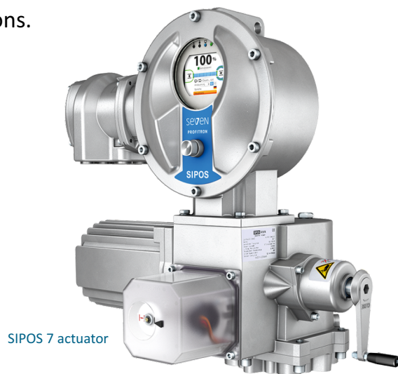
SIPOS 7 actuator

The actuators will be replacing already installed actuators at site for the ID fan application. These actuators offers features like variability in speed, resistance against voltage and frequency fluctuations, no current peaks during start-up as well as gentle operation of the valve by reducing speed in end positions.