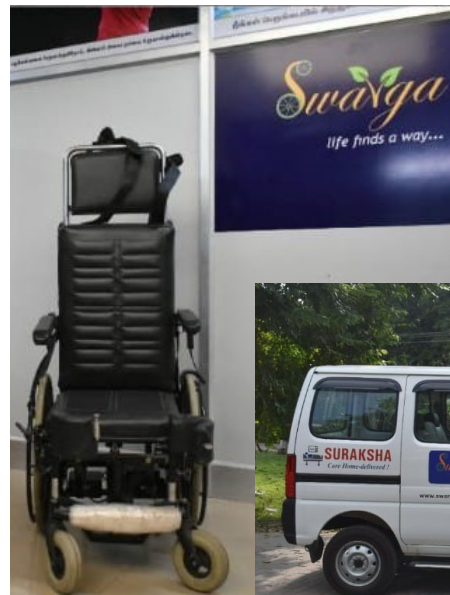
Electric standing chair and a van donated by Auma India to Swarga foundation

Auma India got associated with Swarga foundation recently to support the cause, by donating an electric standing wheelchair for the disabled individuals treatment, a van for logistic support and financial support for the needy who cannot afford the treatment.