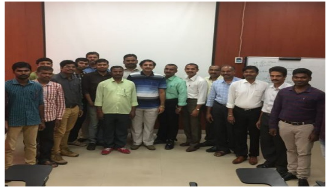
Customer Service Training programme @ AUMA India

'Congratulations on your career milestone, we truly honor you for being a part of AUMA. Your high quality customer relationship as well as your contributions to AUMA are greatly valued and well respected' - AUMA Family