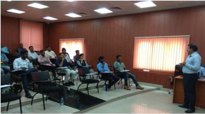
Theoretical session on product know-how @ AUMA India

A 3-day In-house Customer Service Training Programme was organized by AUMA India during 12th - 14th July 2018, which was attended by the delegates from various end-users viz., BPCL - Kochi Refinery, NTPC-Kudgi, JSW-Toranagallu, HPCL - Ennore, NLC-Tuticorin, TSGENCO-Telangana, ISPRIL-Vizag. The training programme was aimed at imparting theoretical know-how along with the demonstration of AUMA products.