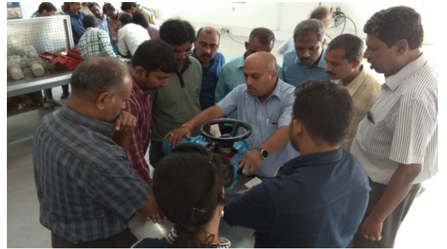
Workshop on Actuator Service Training @ AUMA India