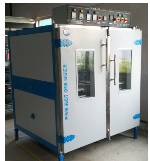
HOT-AIR OVEN: BURN-IN TEST APPARATUS BURN-IN TEST Component: EPAC module in Power-ON condition HOLD-UP Temperature: 70 deg C Time: 4 hrs Quantity: 60 EPAC modules

AUMA India has been performing 'burn-in test' of EPAC modules and recently, an additional capacity has been created in-house to conduct the burn-in test. The burn-in oven that has built-in time setter and auto-shut-off feature can accommodate 60 EPAC modules to perform burn-in test. The burn-in test detect early failures diagnosed from the 'bathtub curve' for reliability of electronics components of EPAC module. Basically, it ascertains the flame retardability and reliable functionality features of EPAC module under extreme operating conditions (elevated temperatures and voltages) as per the customer requirement thereby ensuring the quality & reliability of electronic components used in the EPAC module.