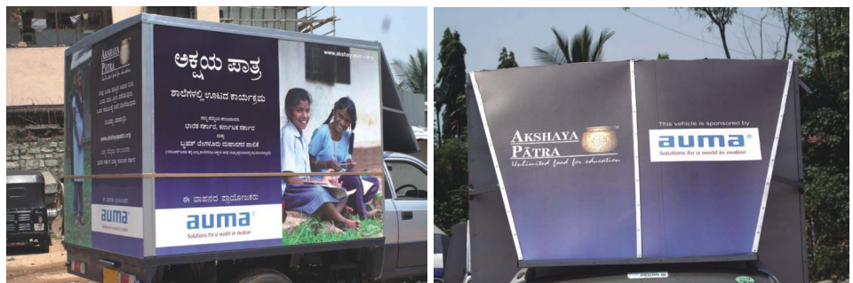
Van provided by Auma India to ISKCON for Akshaya Patra Service.

Auma India as a part of corporate social responsibility activity has provided a food distribution van to ISKCON for 'Akshaya Patra' service, which provides mid-day meals to needy school children. This van distributes free meals for the schools in Bangalore.