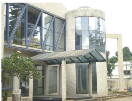
Property acquired by Auma India

Auma India has acquired the neighboring plant earlier belonging to M/s Arvind Mills with an area of 93000 sq.ft and built up area of 60000 sq.ft, which will help Auma India to increase its production capacity in a significant way. We expect to renovate these facilities in the next few months for future expansion plans.