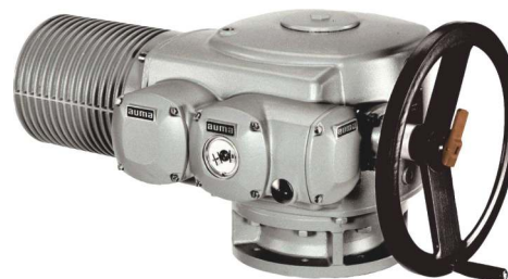
High Torque Actuator

Auma India has developed High Torque Actuators capable of generating torque up to 16000 Nm for direct actuation with or without Integral starters, which have been approved by BHEL, Trichy-Valve Division.