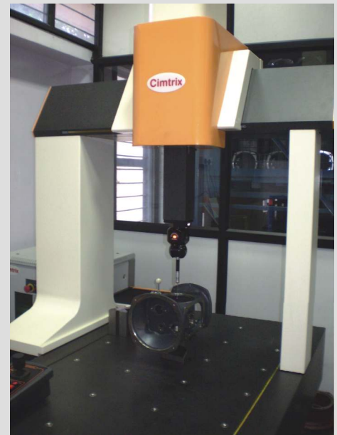
Co-ordinate Measuring Machine

Auma India believes in building quality products for long-term trouble-free operations in the field. Auma India has recently installed a motorized CMM (Co-ordinate Measuring Machine) for accurate measurement. Auma India has also acquired a Surface Roughness Tester of Taylor Hobson make, for measuring surface roughness of machined and ground surfaces.