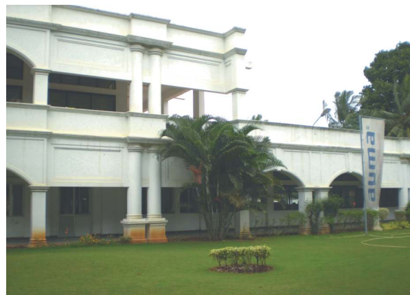
Auma India Manufacturing Unit at Peenya

On this occasion, Auma India launches Infaumation , a quarterly newsletter for effective communication with its customers. Through this newsletter, we shall share developments in the products, projects and manufacturing area with our customers.