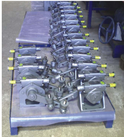
Gearboxes ready for export to China