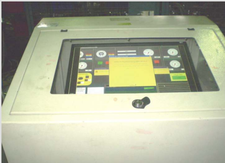
PLC Controlled - Test Rig

Auma India has installed 2 new actuator and gearbox test rigs this year which use PLC/SEMATIC NET. It has significantly enhanced its capability for routine functional testing of its products and life cycle/endurance testing.