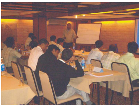
Customer Training conducted on 7-9 Aug 2008